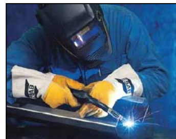
Outstanding Welding Performance